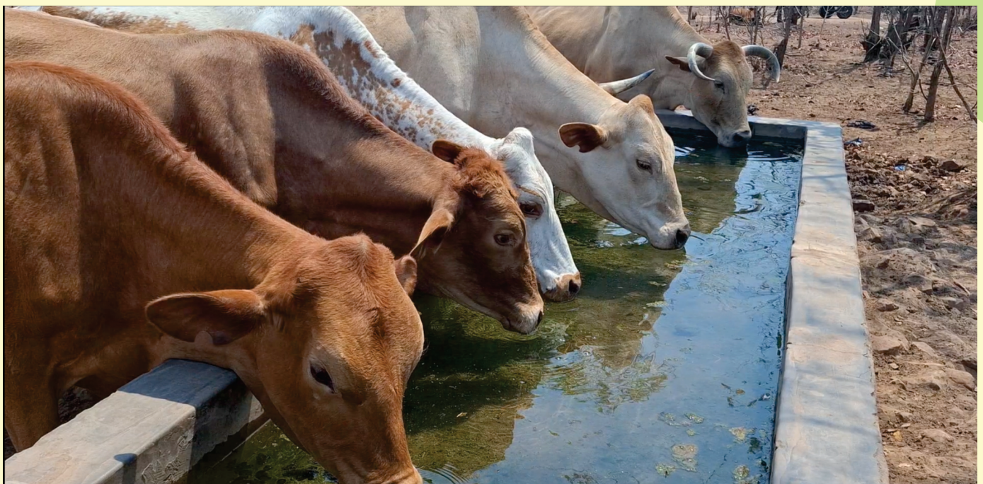
Cattle drink water from a trough which was established as part of interventions by the Smallholder Agriculture Cluster Project

Another positive is that we now have nutritious foods from our nutrition corner. Previously we only cultivated tomatoes and rape vegetables. We now appreciate the nutritional value of spinach and carrots.