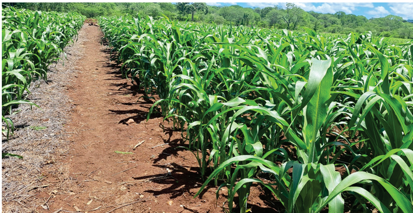
Above -Nambikwa Ncube's crop in February 2025