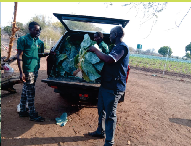
Left- Ndimakule farmers during a recent field day for the village business unit.