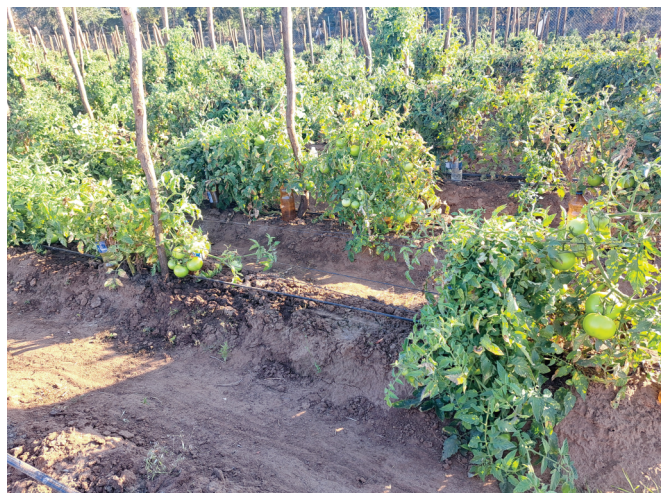
Left - Carrot crop in the nutrition corner Above - Tomato crop at Jabatshaba