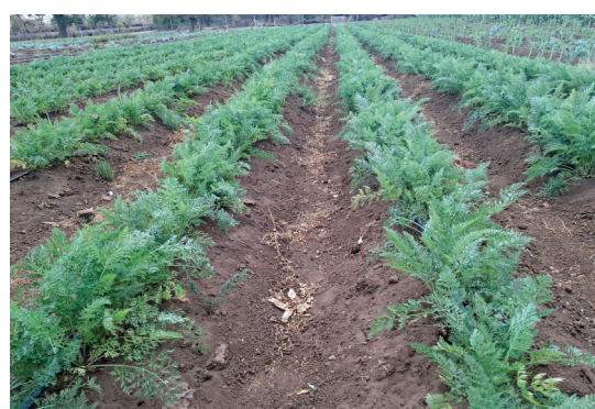
The nutrition corner at Mathambo

In this nutrition corner, each farmer received their area for cultivation. We first planted carrots, then we planted leafy vegetables, spinach tomatoes and onions. We were trained about the nutritional benefits of these crops, for example, we learnt that carrots are good for eyesight while spinach contributes to healthy blood. We no longer have challenges of relish for our meals. As you can see, I look strong and healthy because of the variety of nutritious crops that we cultivate here. Every VBU member is food secure.