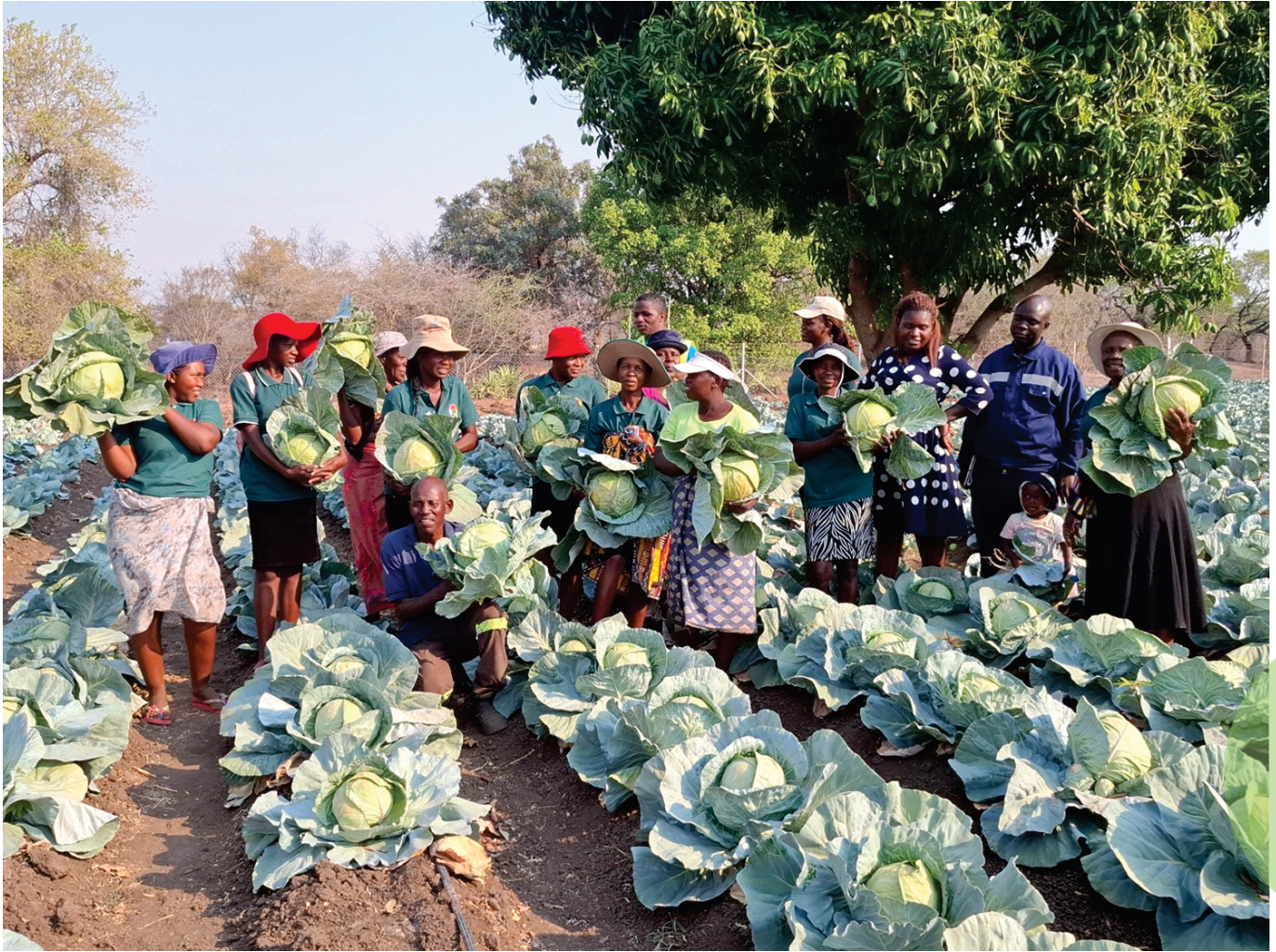
Farmers at Ndimakule display their cabbage crop which is being sold to the market

Farmers at the Ndimakule VBU in Hwange have started selling their produce to off-takers in Hwange and Victoria Falls. The garden, established in September 2024 has cultivated two crop cycles and is selling produce from the second cycle.