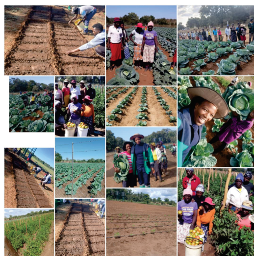
Above - A collage of the first crop cycle at Mathambo