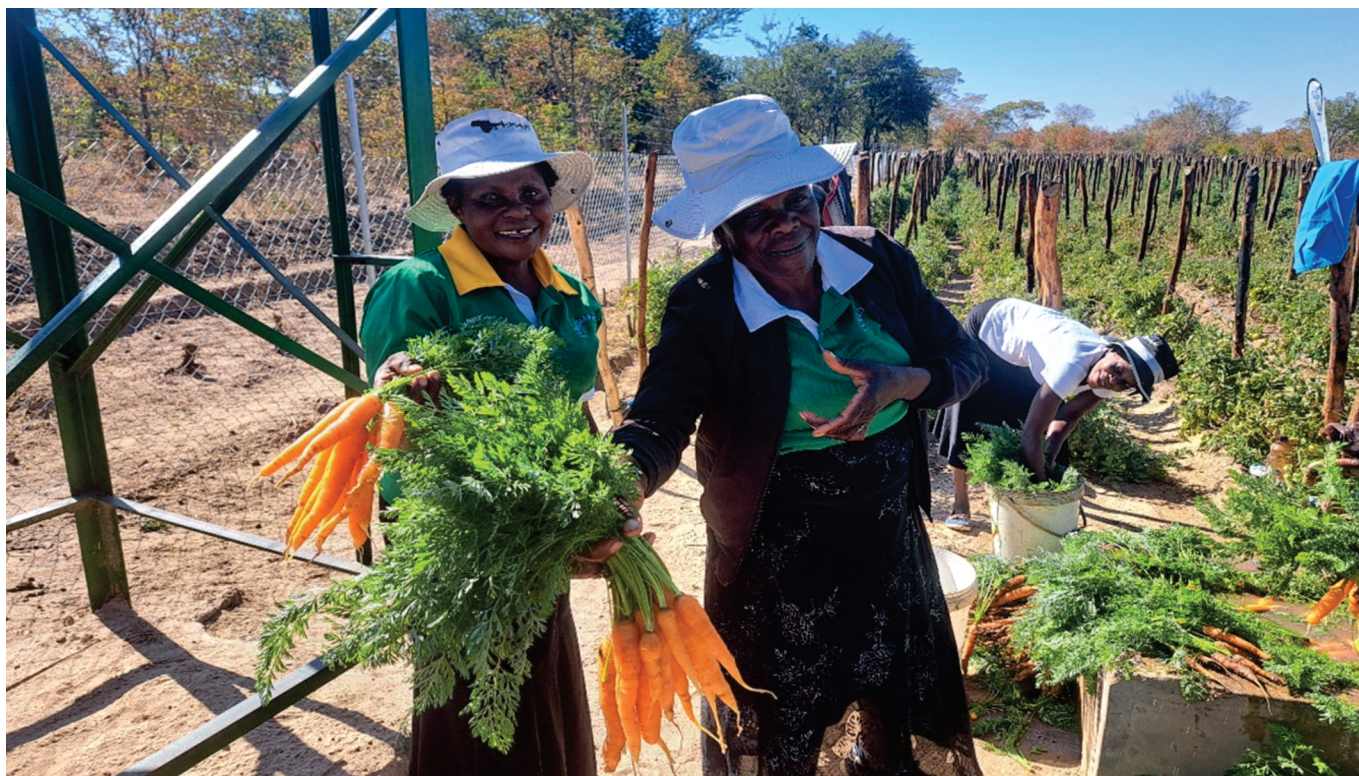
Above -Farmers clean carrots from the nutrition garden for sharing among farmers

Jatshaba Village Business Unit, 50 km north-west of Lupane, the provincial capital of Matabeleland North was established for the rural community by the Smallholder Agriculture Cluster Project (SACP) co- financed by the Government of Zimbabwe, the International Fund for Agricultural Development (IFAD) and the OPEC Fund for International Development (OFID).